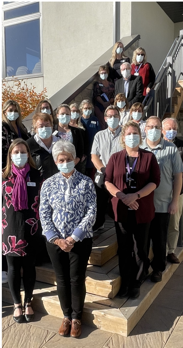
HPCO Accreditors (front center) pose with Hospice staff after their site visit.

After achieving a near-perfect score to become fully accredited late last year, Hospice Peterborough continues to improve policies and procedures to meet the gold standard set out by Hospice Palliative Care Ontario (HPCO).