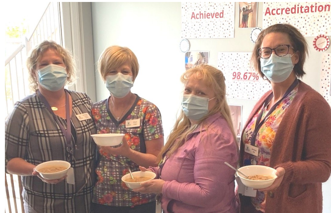
Nursing staff enjoy a chili lunch during National Nursing Week.

Adding to our busy year was the residence gearing up for the accreditation process through Hospice Palliative Care Ontario. While Hospice Peterborough as a whole achieved a near-perfect score of 98.67%, the only recommendations made