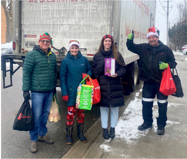
Pictured above: Central Smith's "Fill the Truck" team collecting Kawartha Food Share donations in December.

Hospice Peterborough was delighted to participate in Central Smith's Fill the Truck campaign, along with several other local participants.