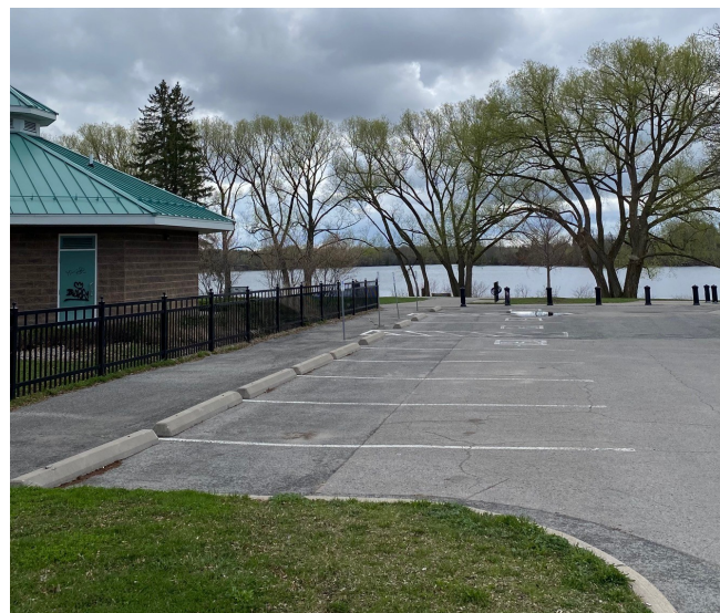
Moving with Grief will meet at Roger's Cove (pictured here) on the 2nd and 4th Monday of each month.