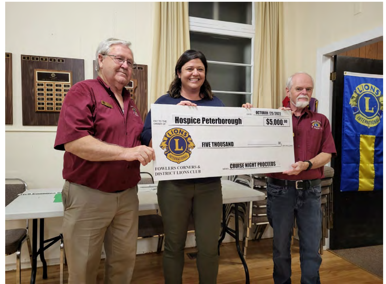
Fowler's Corner Lion's Club presented five local charities, including Hospice Peterborough, with cheques from the summer Cruise Night at Craftworks.