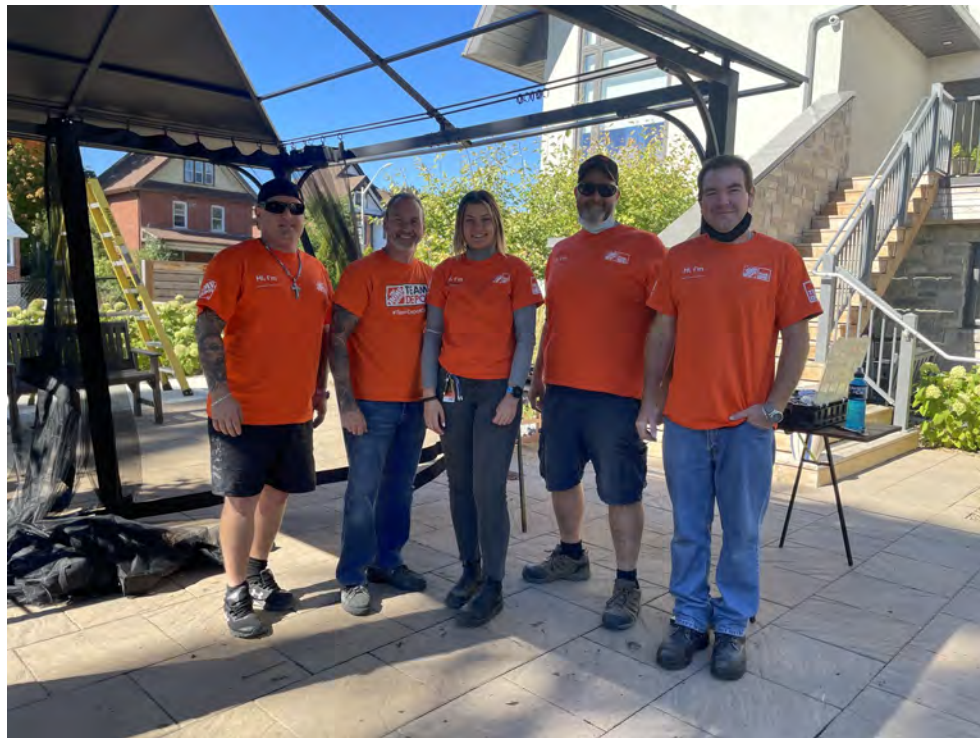
Home Depot employees provide yard work, pergola for Hospice client's comfort and enjoyment

Posting is open until November 30, 2022.